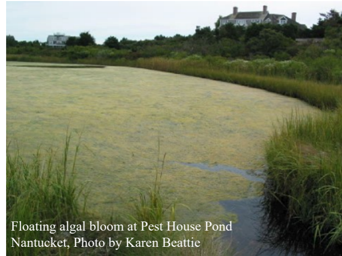
Floating algal bloom at Pest House Pond Nantucket, Photo by Karen Beattie

Floating scum resembling green streaks, clumps or spilled paint are often rapidly growing microscopic cells of algae, diatoms, protists or bacteria.